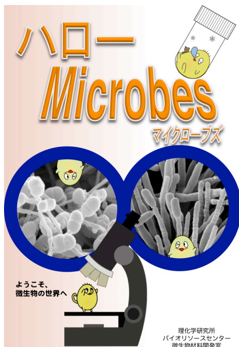
Cover of a booklet "Hello Microbes" (edited by JCM to introduce the world of micro-organisms to the public, only in Japanese) distributed at the JCM booth.

Most people in the public may be unconscious of the presence of microorganisms in their daily lives. Some may had an image that microbial bugs are just cause diseases or rot organic materials. People may know that microorganisms are useful in production of fermented foods such as Miso (bean paste), Shoyu (soy sauce) and yogurt: but they may not be so familiar with the microorganisms involved in the fermentation processes. Thanks to Prof. S. Ômura, who won the Nobel Prize in medicine and physics last year for the discoveries concerning a novel therapy against infections caused by roundworm parasites, researches using microbes might have drawn spotlight in the public.