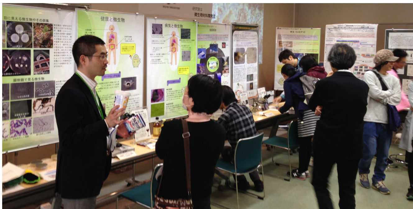
A scene of the JCM booth. Vistors dropped by the booth all the time during the open campus.